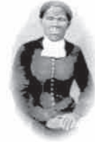
Harriet Tubman Administration Building