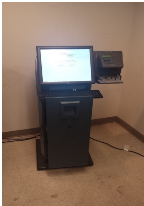
A Probation Kiosk