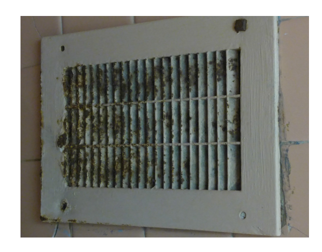
Figure 4 – Dirty, Rusting Air Vent

Figure 2 – Cigarette Butts Littering Wood