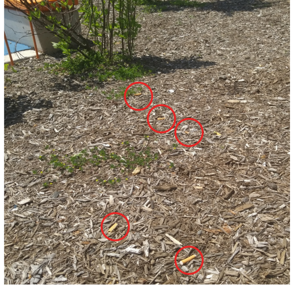
Figure 2 – Cigarette Butts Littering Wood