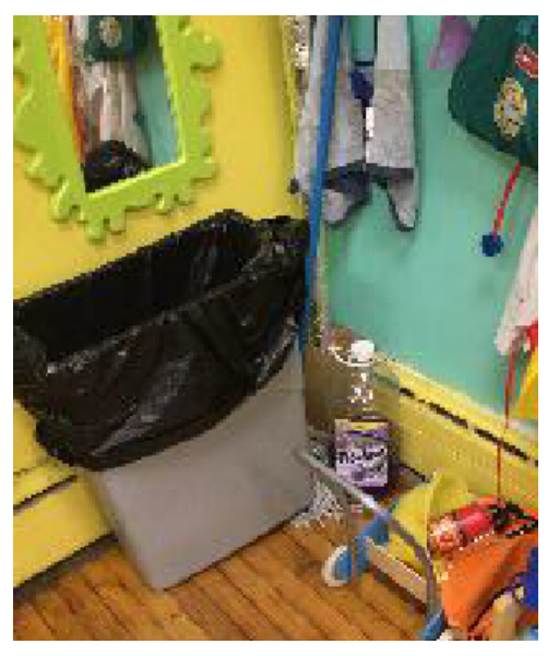
Figure 10 – Improperly Stored Toxic Cleaning Product

We note that schools in the UPK program are governed by the Law and the Regulations, which require buildings and classrooms used for UPK programs to be safe and suitable for children. Therefore, regardless of who is operating a UPK program (i.e., DOE, CBO), children should not be exposed to conditions that put their health and safety at risk. The DOE should communicate to all NYC UPK providers the importance of maintaining a safe and healthy UPK environment. Going forward, the DOE should work with DOHMH to ensure that the requirements governing school-based and center-based programs are aligned to prevent confusion among providers, to improve compliance, and to ensure safe and healthy conditions.