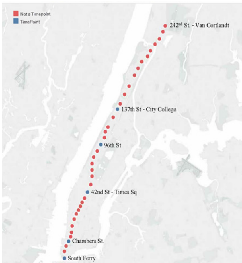
Figure 1 – Time Point Locations for Number 1 Line (Northbound)

Even though the time points were selected based on customer traffic, OP failed to include key subway stations such as Penn Station, 59th Street-Columbus Circle, and 14th Street. These stations had the second, third, and fourth highest rates of ridership, respectively, in 2017 and on average from 2012–2017. Moreover, these subway stations provide transfer options to nine subway lines, the Long Island Rail Road, Amtrak, New Jersey Transit, and Port Authority Trans-Hudson, as well as transportation options to the airport.