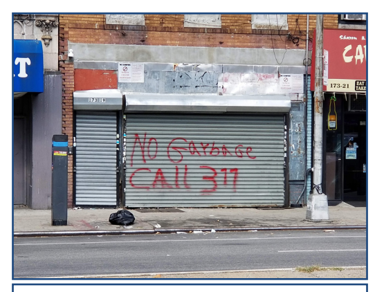
Image 1 (left to right): Conditions observed during three visits to a sampled blockface in Queens (July 9, July 16, and September 24, 2019, respectively).