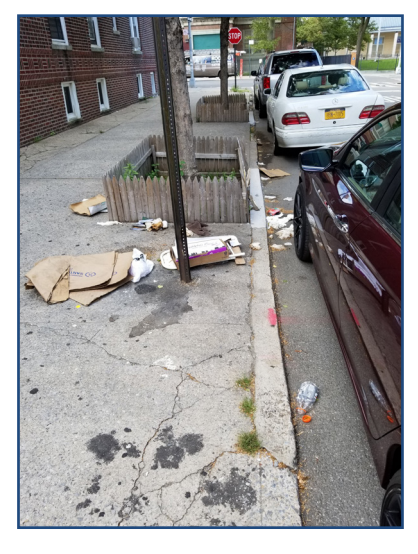
Image 2: (Left) Street and sidewalk conditions observed on our first visit to a sampled blockface in Bronx. (Right) Observations of deteriorated conditions at the same blockface one day later.

Along with significant litter issues (e.g., unsecured litter, overflowing litter baskets with spillage, and litter dump areas), we also observed unsanitary conditions (feces, vomit, soiled diapers, decaying animal/rodent carcasses) and instances of opened hydrants flushing litter through the streets and, in some cases, down storm drains. None of these conditions were identified by DSNY.